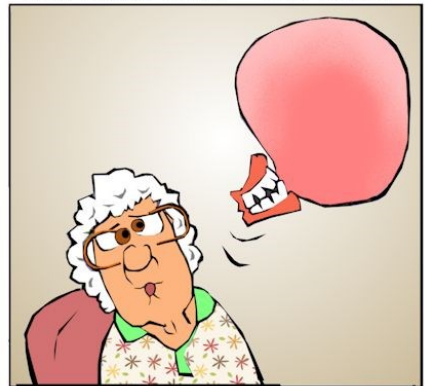
Seniors chewing bubble gum. On tonight's 10pm news.

The first full week of June is Senior's week!!! Here in the lovely Village of Warburg, we cannot understate the value and respect we have for our Senior Community Members. They can be counted on for everything from Pancake breakfasts, board membership, delicate tailoring to grandmotherly/fatherly advice and friendly smiles as they pass their neighbors. Our seniors built this community into what we are able to enjoy today, and this week, along with all weeks, we celebrate you!