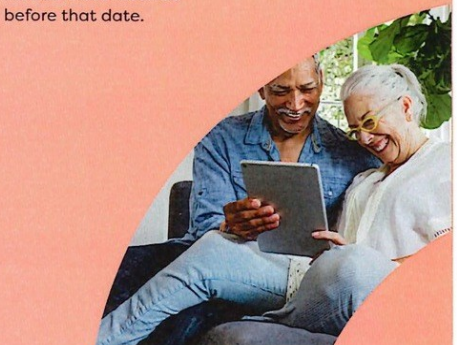
For more information, visit Canada.ca/dental

Coverage will begin on the date provided in your welcome package from Sun Life. Appointments with an enrolled oral health provider should be scheduled as of that date and no sooner for the eligible oral health care services to be covered under the Plan. The CDCP will not reimburse you for oral health care services received